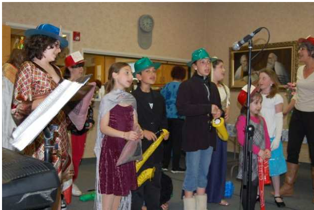
Junior Choir performing at Sisterhood Purim Dinner

She is at Burbank Health Care, 1041 Main Street in Burbank.