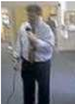
Rabbi singing "My Way" in Hebrew at our Karaoke party

At our last meeting, Sisterhood voted to donate funds for the purchase of 50 new Shabbat prayer books. These books will have name plates inserted as donated by the Sisterhood.