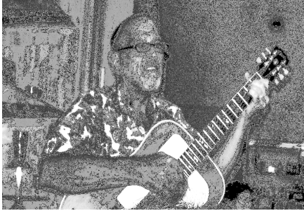
Men's Club BBQ June, 2009