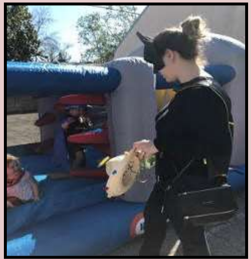
One of our preschooler's mom had the Purim spirit as she joined in wearing a Batgirl costume!