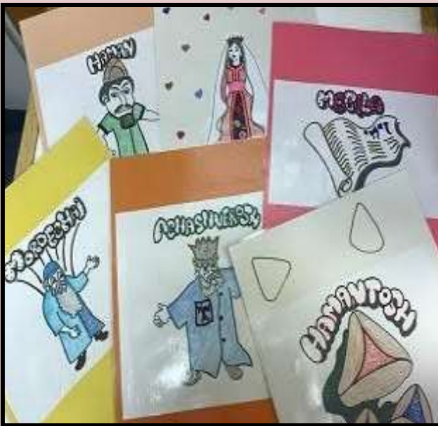
We used colorful Purim cards to tell the Purim story!