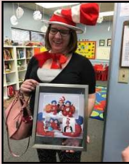
This "Cat In The Hat" looked a lot like one of our visiting moms! Hmmm!