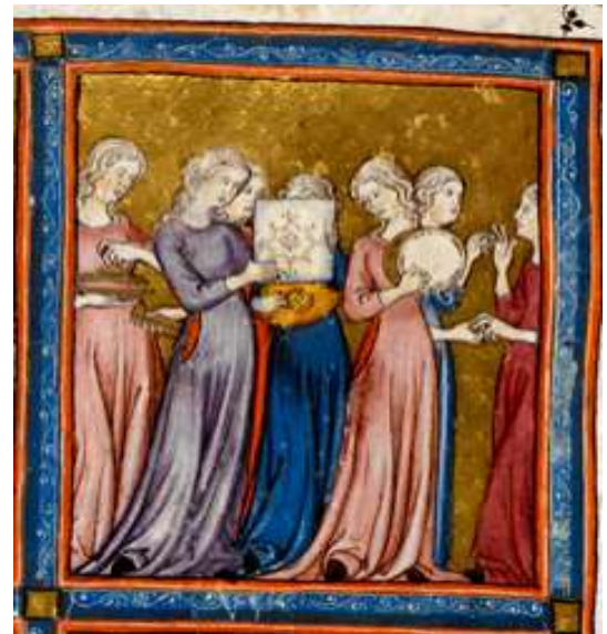
The Women's Seder