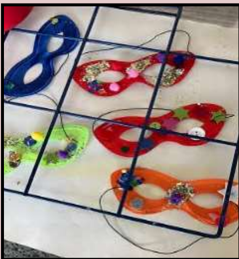
We decorated face masks with jewels and stars! We think each one is a masterpiece!