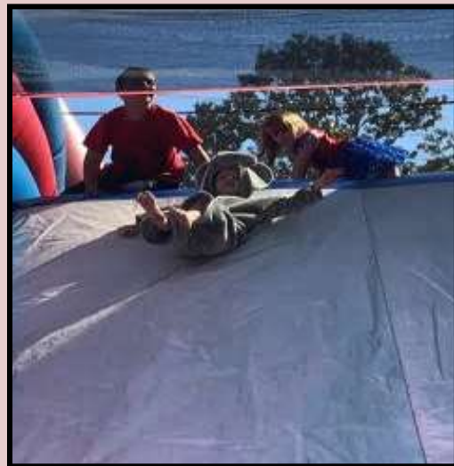
One of our "elephants" is loose! And it took a ride on the giant slide!