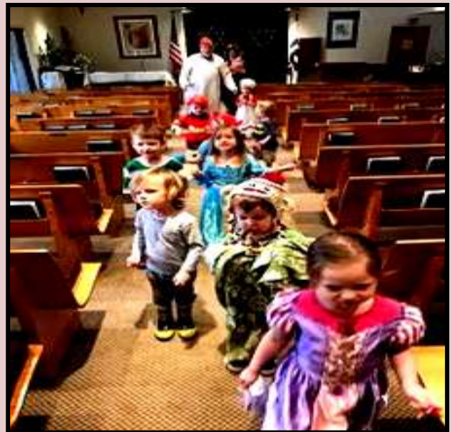
Our parade through the Sanctuary was fun and delighted our little ones for this festive holiday!

Now that our current families have turned in re-enrollment forms for next year, we are now ready to open enrollment to the wider community. If you or someone you know is looking for a nurturing, hands-on, play-based preschool/prekindergarten program, we are proud to say, "TBE Preschool is it!" Please feel free to contact me at either (818) 861-7660 or preschool@templebethemet.com . I would be happy to show you your temple preschool and talk about a program of which I am so proud to be a part.