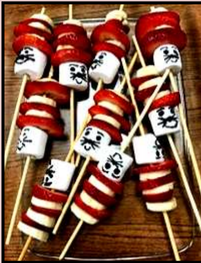
Delicious Cat In The Hat Kabobs! Yum!

After celebrating the VERY important Birthday of Dr. Seuss, including a special lunch of " Green Eggs and Jam ," we switched gears and moved on to the Holiday of Purim. The children listened carefully to the preschool version of the story about a King, the VERY beautiful, smart and brave woman who became his Queen, her uncle and a VERY bad man, who's name we do not want to hear! By the end of the week, the children not only knew the story BUT they were also acting it out. In addition to the special lunch, the celebration of Dr. Seuss' Birthday included Pajama Day , Crazy Hair Day , and Wacky Wednesday -a day for mismatched shoes and socks...everyone got into the act!