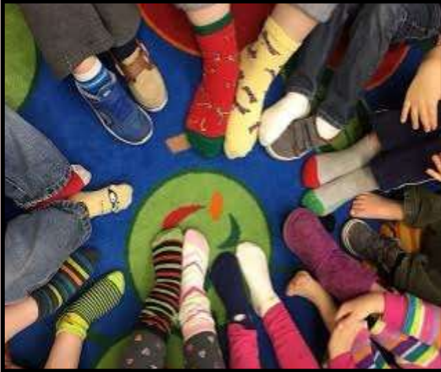
Wacky Wednesday brought out the creative side of our students' stocking feet!