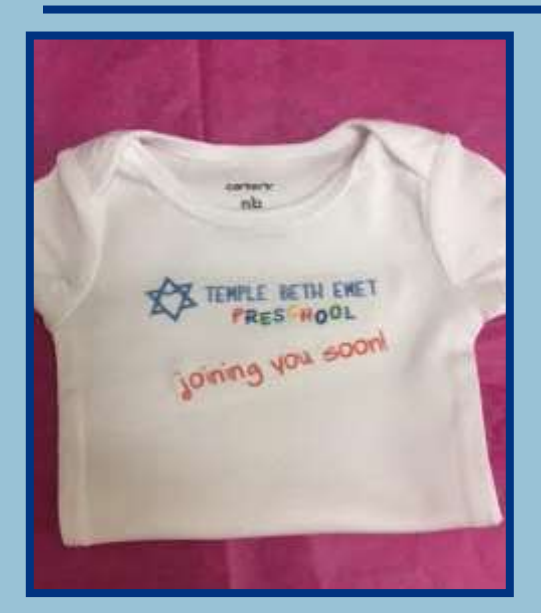
This photo needs no explanation... its just adorable and very useful for the littlest learners among us!