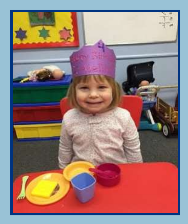
A happy birthday girl! There's nothing more heartwarming than a happy child!