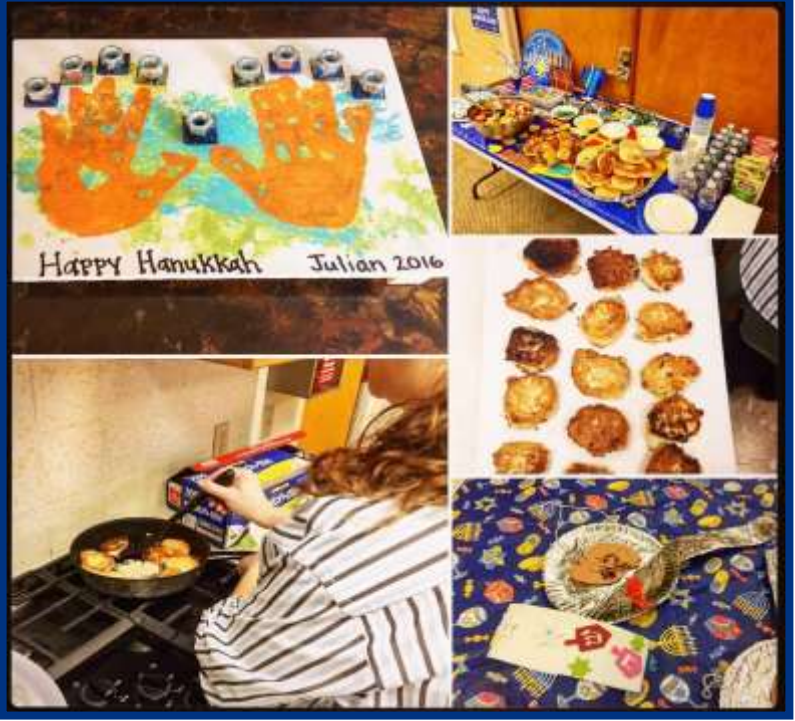
Hanukkah was happily celebrated by our preschool children with the help of some loving and helpful Hanukkah helpers.