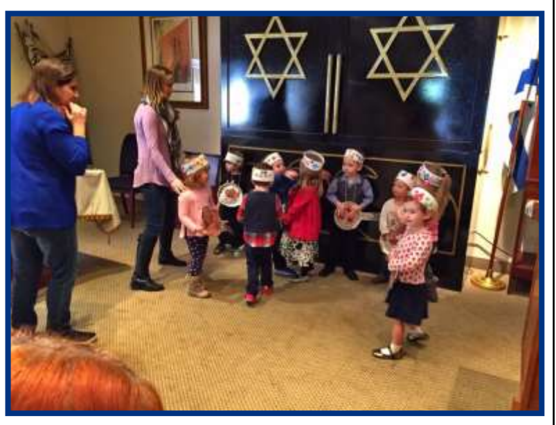
Our little preschool children prepare to offer a first rate musical presentation for Hanukkah... they turned in a stellar performance!