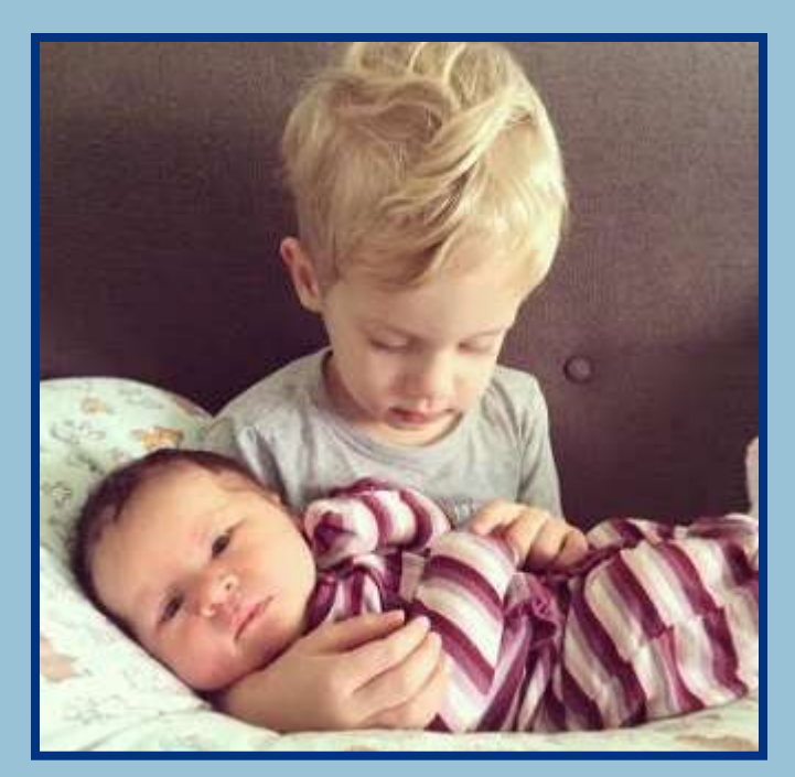
With all the firsts this year, we are thrilled to announce the second baby born to a TBE Preschool family! Congratulations!

This has been a month of first's at Temple Beth Emet's Preschool! The first Room Parents selected, the first Share Day initiated (rocks that came all the way from Arizona), the first professional photos taken, the first Birthday celebration, the first Pajama Day, the first Thanksgiving Feast and now Hanukkah and "December Holidays, the Musical!". Oh, and the second one of our TBE Preschoolers to become a big brother!!