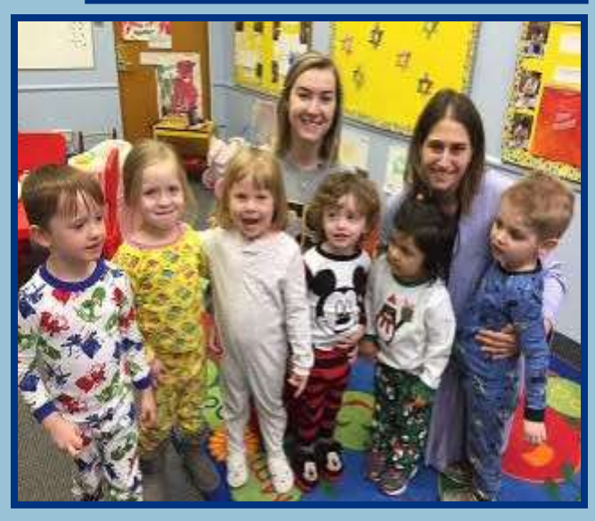
Pajama Day at Preschool! A nice, relaxing day for the children... ready for naptime, way in advance!