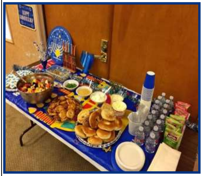
Hanukkah. Our little preschoolers had a wonderful celebration at Preschool.