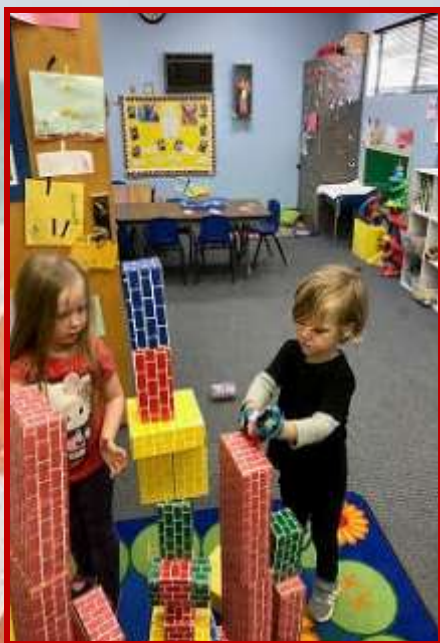
Hands on learning...