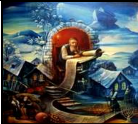
Art by Boris Shapiro

https://www.facebook.com/ TempleBethEmet?ref=ts