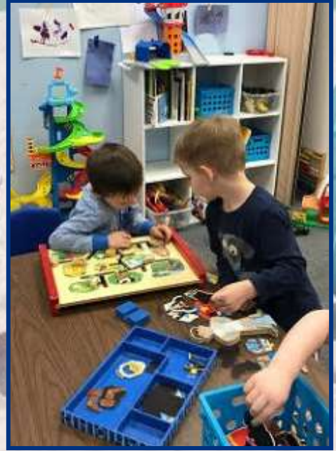
Getting to know each other. . .