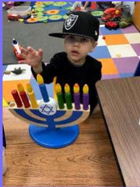
this is a sample of the Hanukkiyah created by our Monkeys. . .