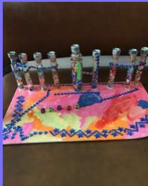
and a sample of one created by our Lions. . .