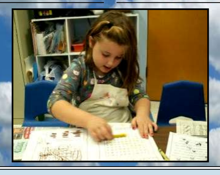
Another Butterfly Artist in the making.