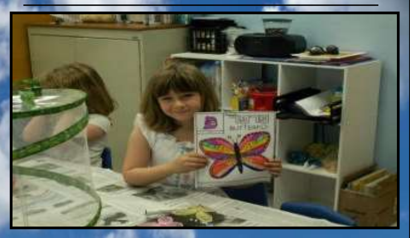
Rainbow colored Butterflies emerge on pages from a child's imagination. What a treat to see them alive and released to fly away!