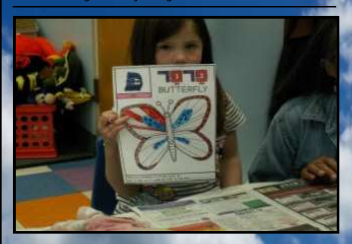
Another artistic expression depicting the Par Par.