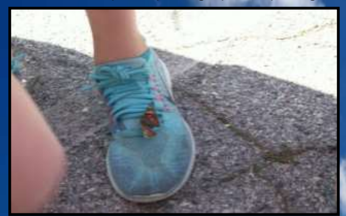
A new Butterfly catches its breath on a student's shoe, before taking off and joining the environment.

Here are a couple of photographs depicting that event: