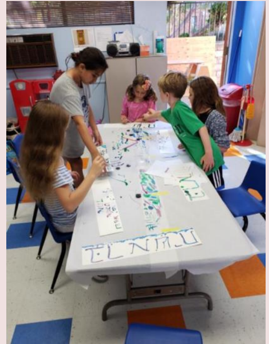
Making Mini-Torahs for Simcha Torah