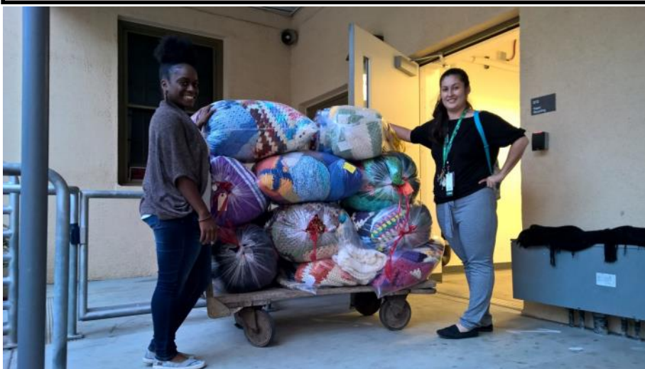
57 afghans delivered to permanent supported housing .