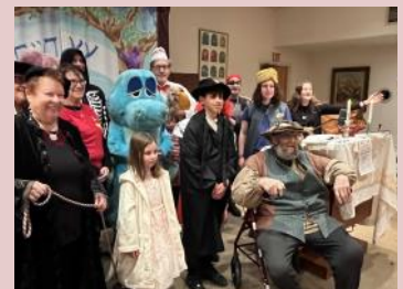
Lots of people came in costume to Purim!