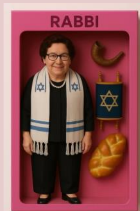
Rabbi Bieber action figure!