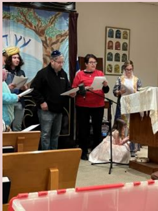
Our Religious School put on a Purim Spiel