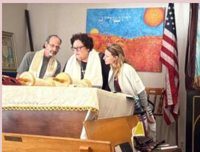
Torah reading at our first Saturday Shabbat service