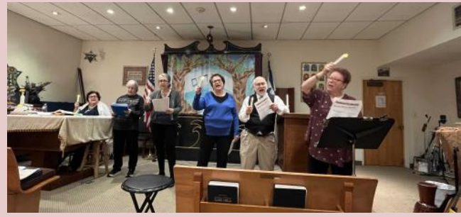
Our choir leads us in Hanukkah songs at Shabbat services